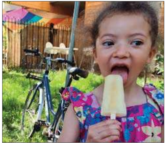
'Market testing' an early lolly in Flo's garden

No Vice Ice is a social enterprise that aims to tackle the stress and isolation caused by long term and invisible health conditions through ice lollies... as well as supplying a delicious natural and sustainable product!