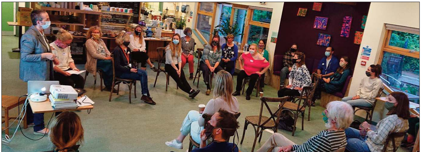
A meeting of all the staff at Flo's in September 2021

Incubating a new social enterprise can take 2 or 3 years in any circumstance and we are learning more about the additional considerations required for those who have experienced trauma, isolation, barriers of language, culture and connection. Financial limitations, experience, health, family and other commitments, mean that continued appropriate investment will be needed for them to thrive and grow in the next 2 years.