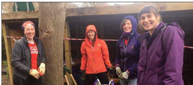
Volunteer gardeners from Good Gym Oxford