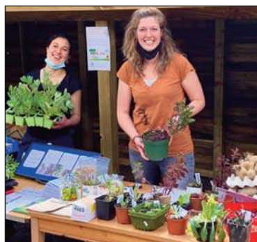
Replenish seed and plant swap in the garden at Flo's, May 17 2021

We were lucky to host one of the Replenish seed swaps this spring run by CAG Oxfordshire .