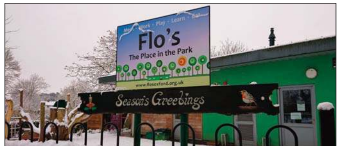
Snow settles on Flo's in January 2021