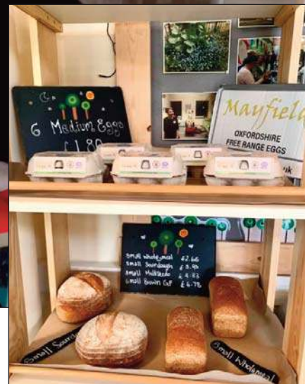
We now stock fresh bread and free-range eggs

Three of our Volunteers have started working in the Café – going from unpaid to paid positions.