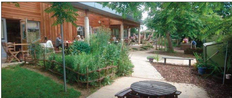
The garden at Flo's Cafe