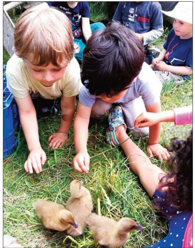
Meeting the ducklings, August 2021

"Thank you for creating the amazing Flo's nursery. We could not have asked for a better place for [our children] to go. All of your staff exude such a warmth and love for the children. It truly is like a home from home and big family! They have thrived at the nursery. We will miss you so much and never forget you." (July 2020)