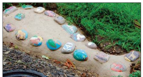
Some of the sponsorship stones at NaturEscape